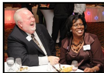
Above: Mayor Dan Tovo, Village of Monee, left, and Mayor Vivian Covington, Village of Univeristy Park