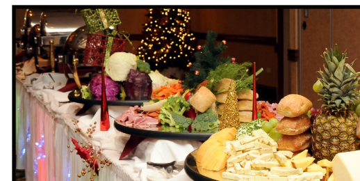
Right: Reviews of the food at the DoubleTree by Hilton Chicago-Alsip ranged from "Delicious!" to "Incredible!"